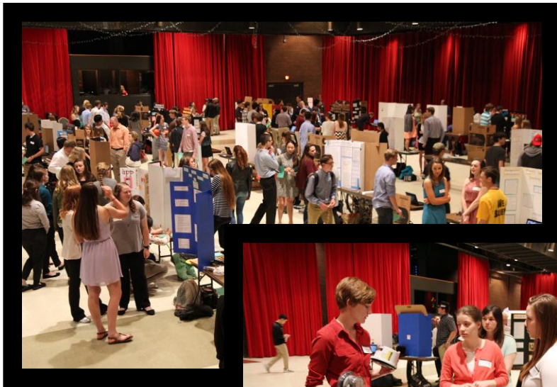
HSRS Poster set-up in the Brown Ballroom