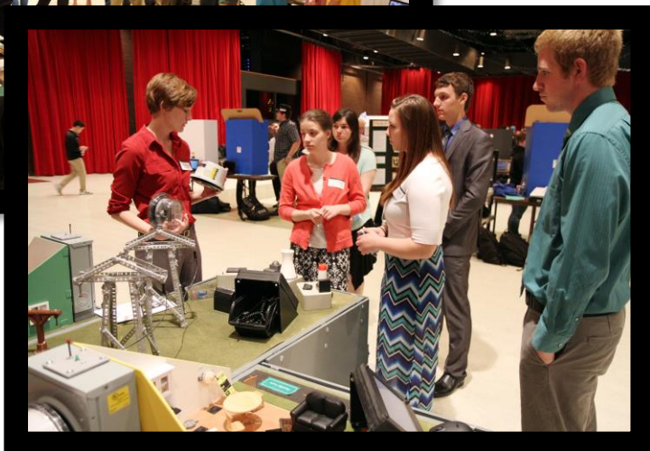
Participants in the ISU High School Research Symposium