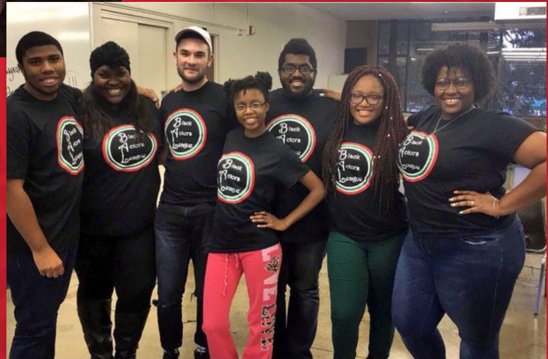
The Black Actors League (RSO)